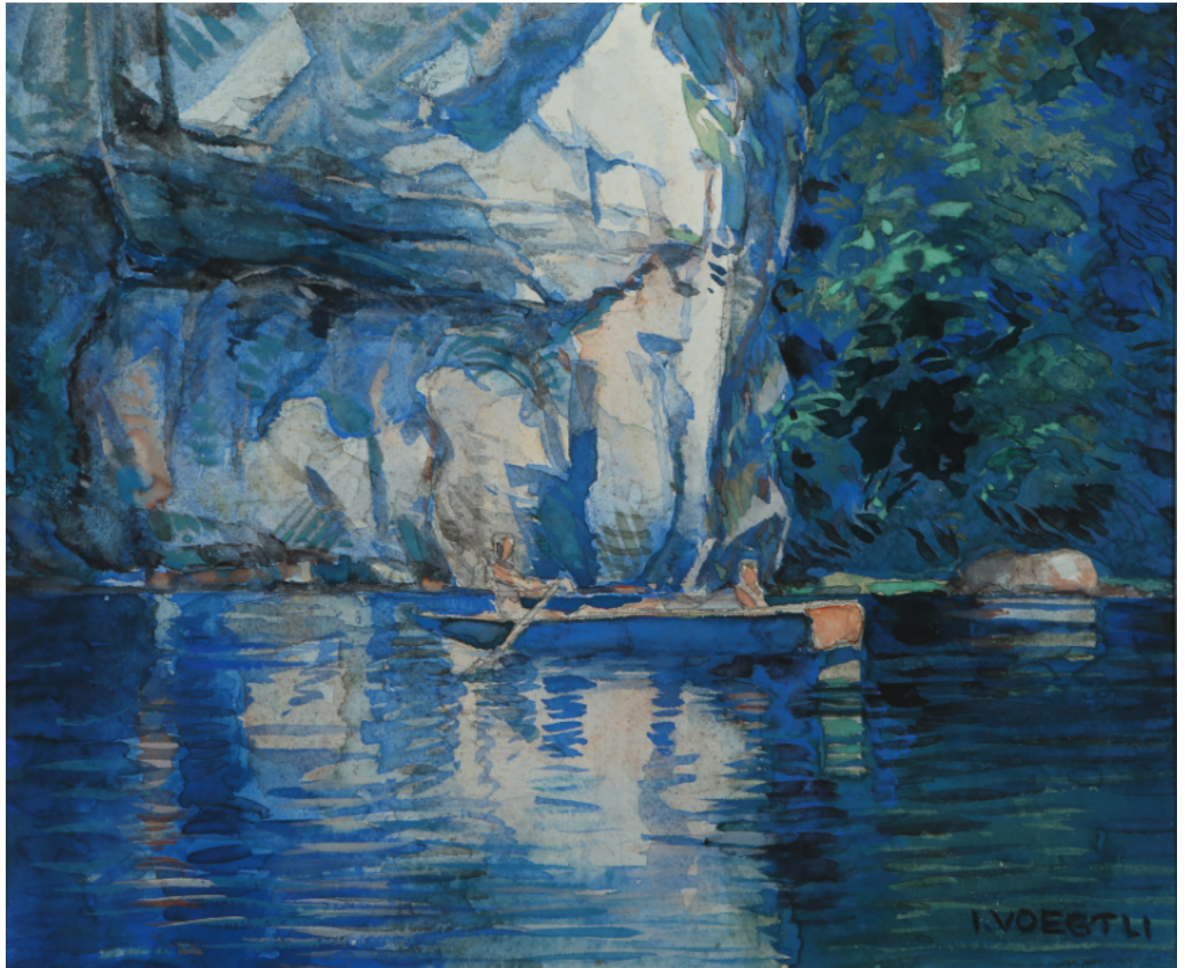
Left: Julius Voegtlí, Self Portrait , 1910. Watercolor on paper, 15 x 18 cm. Courtesy of Hans Vögli. | Above: Julius Voegtlí, Aare Gorge , early 20th Century. Watercolour on paper, 14 x 18 cm. Courtesy of Hans Vögli.

www.pashminart-consortia.com | www.julius-voegtli.ch